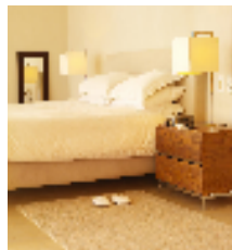
HOUSEKEEPING AND LAUNDRY SERVICES

We are here to take care of your cooking, cleaning, laundry, shopping, maintenance, yard work, organizing, or moving so you have time for the things you really enjoy doing.