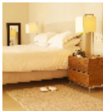
HOUSEKEEPING AND LAUNDRY SERVICES

We are here to take care of your cooking, cleaning, laundry, shopping, maintenance, yard work, organizing, or moving so you have time for the things you really enjoy doing.